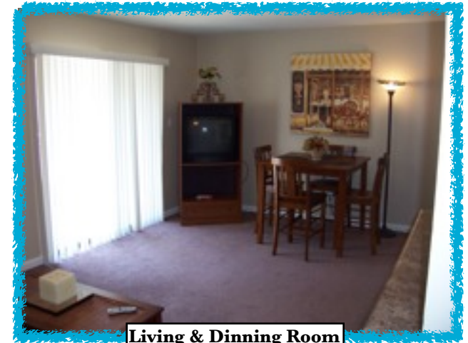
Living & Dining Room