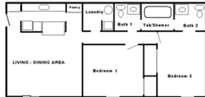
Greenbrier Apartments 2 Bedroom Unit

Corporate Units & Unfurnished Units Floor Plans are the Same