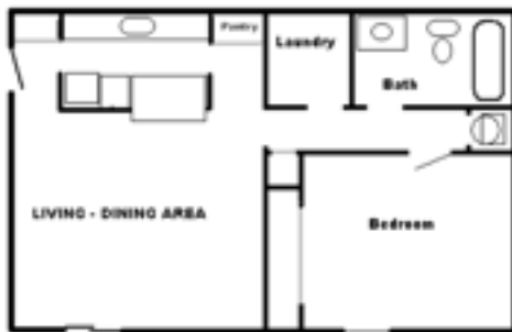
Greenbrier Apartments 1 Bedroom Unit

Corporate Units & Unfurnished Units Floor Plans are the Same